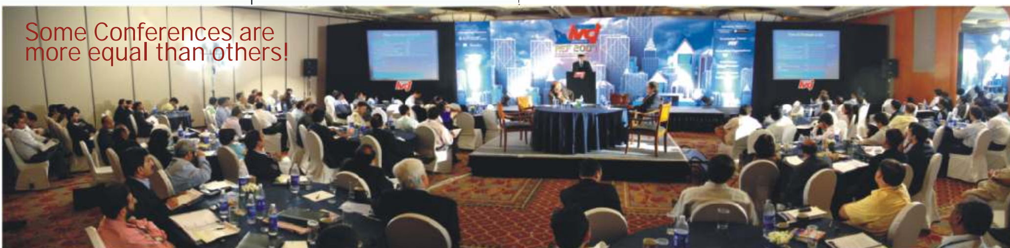
IVCJ's conference REF 2007, held on 12th - 13th July, 2007 at JW Marriott, Mumbai

Kindly send in the duly filled Registration Form along with Registration Fees to the following address: Dickenson Intellinetics Pvt. Ltd., 9th Floor, '9 JVPD' Building, 10th N.S. Road, Juhu, Mumbai - 400049, India Tel: + 91-22-26252282 / 5570 2791 / 3293 8218, Fax: +91-26252282 ext.109, Email:sales@vcindia.com/info@vcindia.com