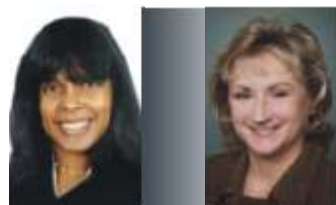
Some of the eminent speakers from IVCJ's 1 st Life Sciences Conference in Nov 2006